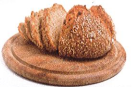
Bread & Butter