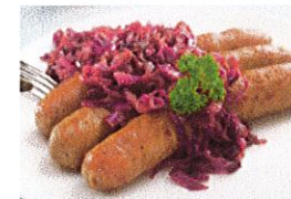
& Red Cabbage