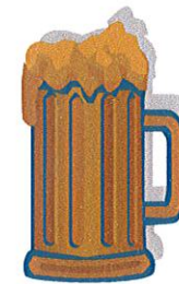
Birch Beer or Other Soft Drinks